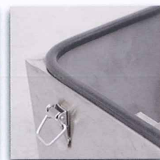
* Rubber Gasket*