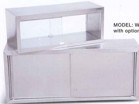
MODEL: WMC903561 with optional glass door

* Optional Glass Door & Front & Back Door * * Custom Made Size Are Available