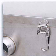
* Safety Lock*