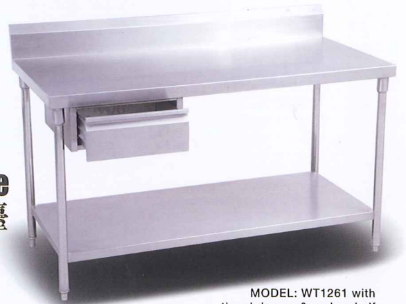
MODEL: WT1261 with optional drawer & under shelf