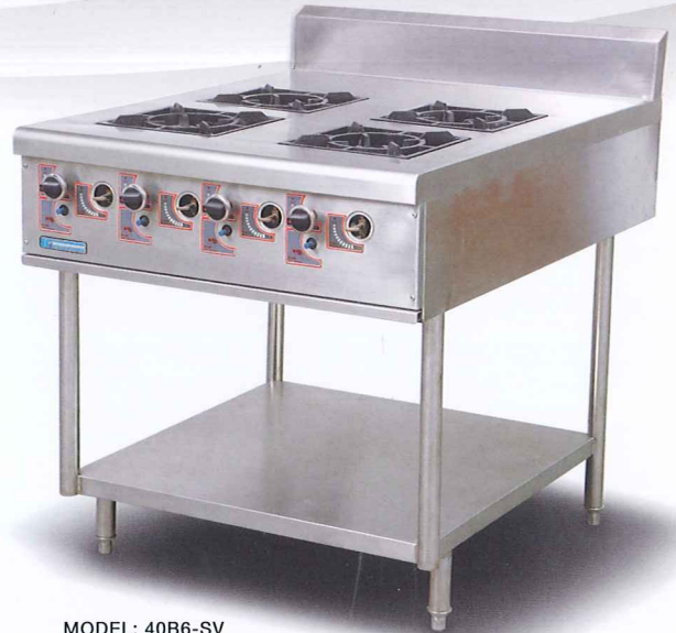
MODEL: 4OB6-SV with optional undershef