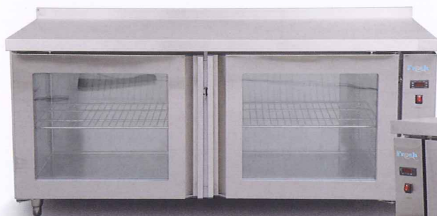
Model with optional glass door